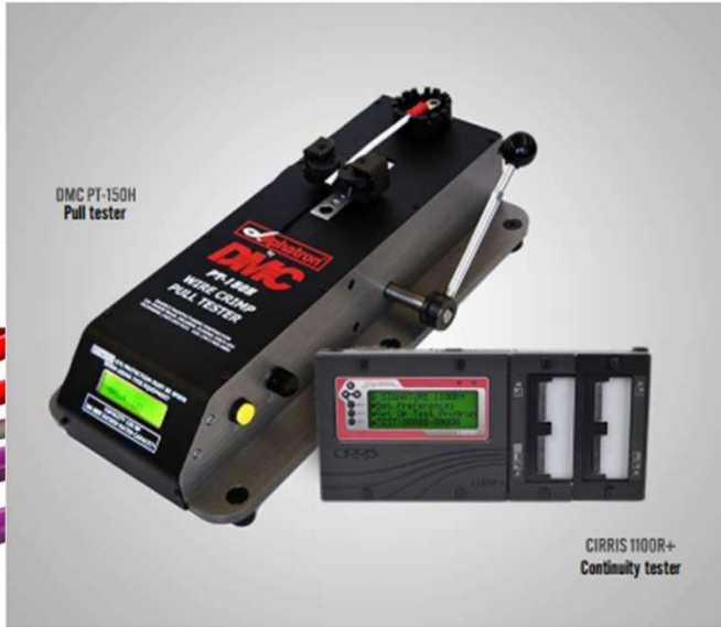
DMC PT-150H Pull tester