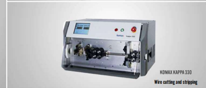
KOMAX KAPPA 330 Wire cutting and stripping