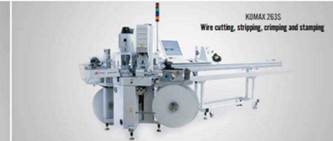
KOMAX 263S Wire cutting, stripping, crimping and stamping